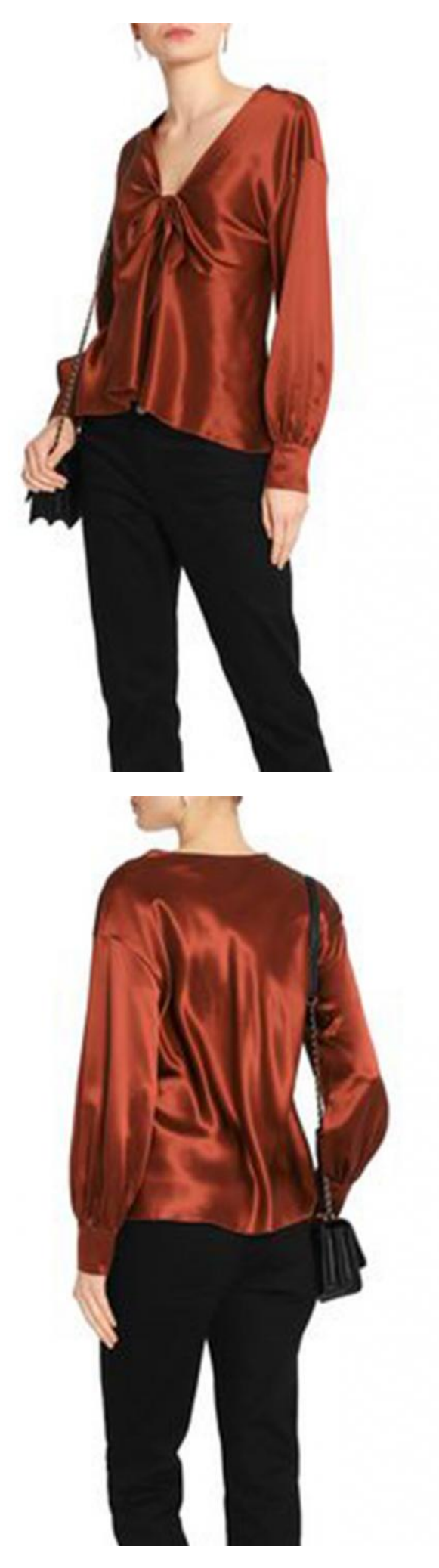
100% polyester & satin