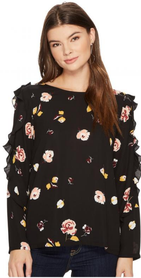
Keyhole with button closure at nape