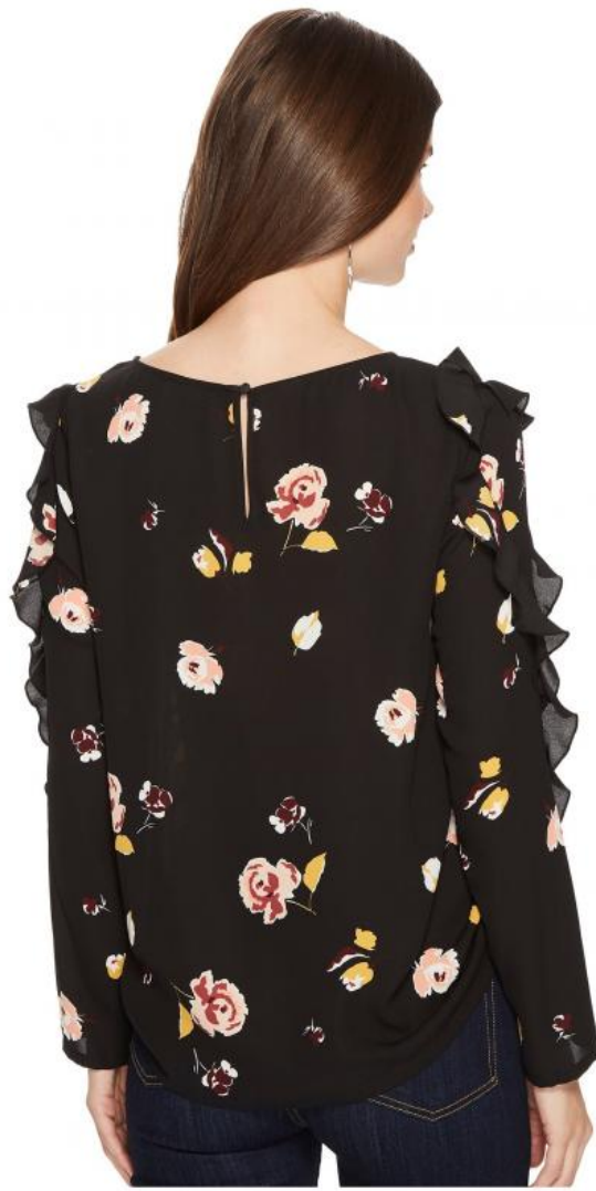
Cascading ruffle trim down the long sleeve