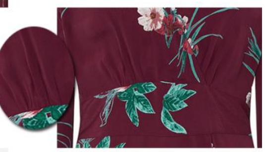
Wrap Waist With Ruffles