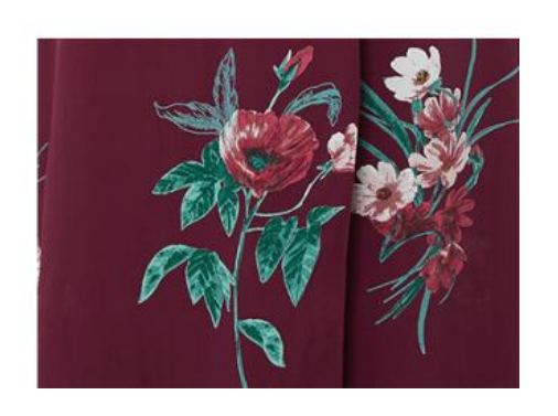
Floral Printing & 100% Viscose